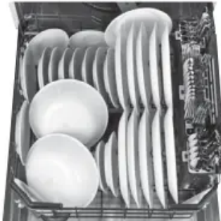
Lower Rack - 10 Place Settings GDF620 & GDT635