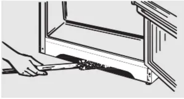
Cleaning the condenser coils.