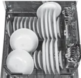
Lower Rack - 8 Place Settings GDF620 & GDT635