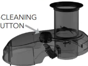
LID AND PULP GUARD