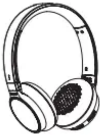
Philips Bluetooth stereo headset SHB9150