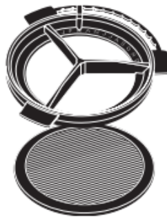
Water Filtration System