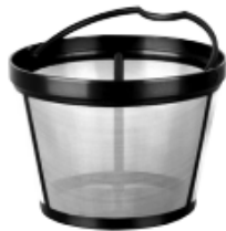
Mr. Coffee® Brand 8-12-Cup Permanent Filter

Coffeemaker Extras (not included with all models)