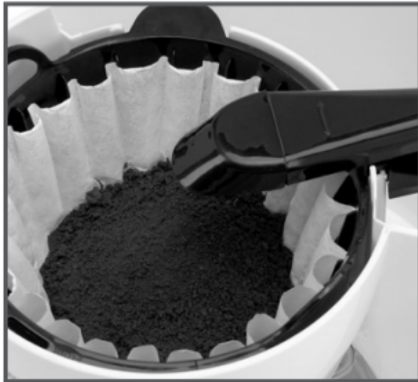
(Figure 3 – Adding water and ground coffee)

NOTE: If using paper filters, it is important that the sides of the filter fit flush against the side of the filter basket. If filter collapse occurs, dampen the filter before placing in the filter basket and adding ground coffee and water.