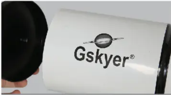
23. Open the objective lens cover.