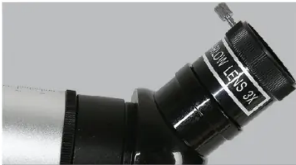
19. Installing 3X Barlow lens. (advise not use for viewing landscape)