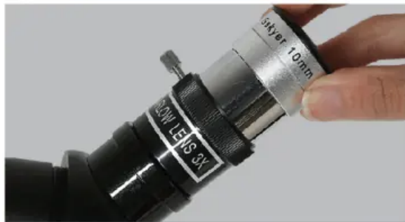
21. Insert 10mm eyepiece into 3X Barlow lens. (advise not use for viewing landscape)