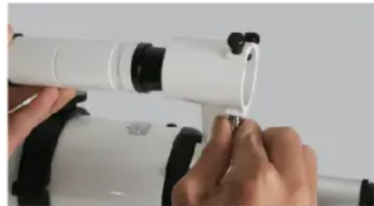
12. Pull down the metal stretching screw and slide finderscope into the hole on base.