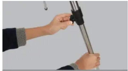
2. Use tightening screw to secure the extended legs in certain length.