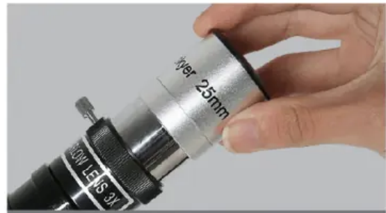
20. Insert 25mm eyepiece into 3X Barlow lens. (advise not use for viewing landscape)