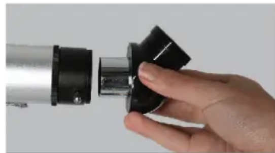
14. Insert zenith mirror into the focuser.