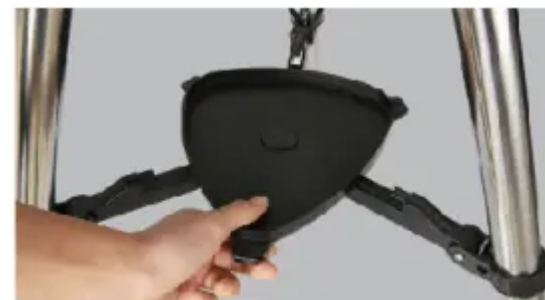
4. To assemble the accessory tray, first line up notches