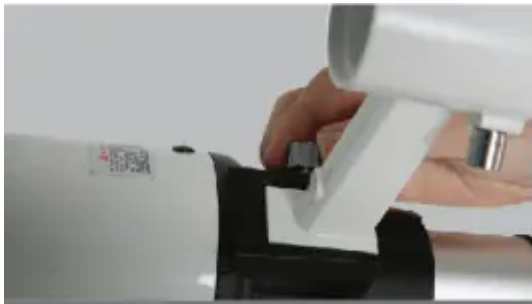
11. Tight the screw on finderscope base.