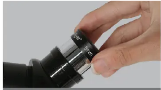
18. Insert 5mm eyepiece into zenith mirror.