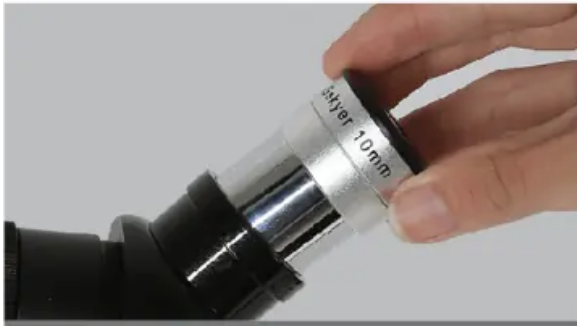
17. Insert 10mm eyepiece into zenith mirror.