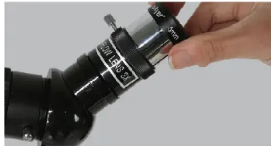
22. Insert 5mm eyepiece into 3X Barlow lens, (advise not use for viewing landscape)