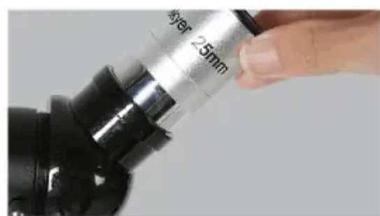
16. Insert 25mm eyepiece into zenith mirror.