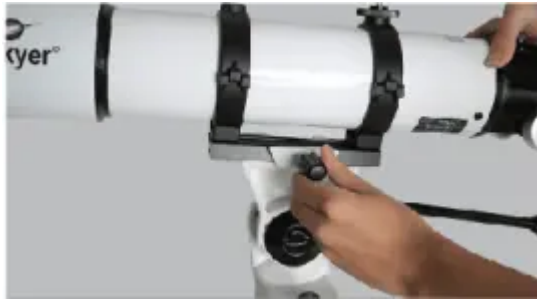
9. Tighten the body tube set screw.