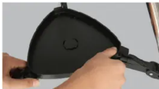
5. Then turn clockwise to make tray tabs lock into tripod brackets