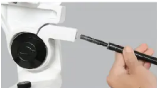
7. Combine handle with AZ Altazimuth Mount.