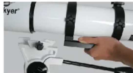
8. Place body tube