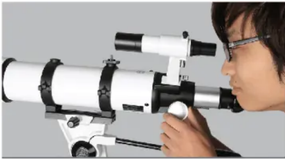
25. Finderscope's observation, (inverted image)