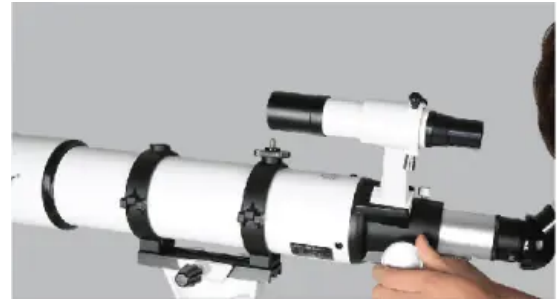
24. Turn the focuser wheel to make field clear.