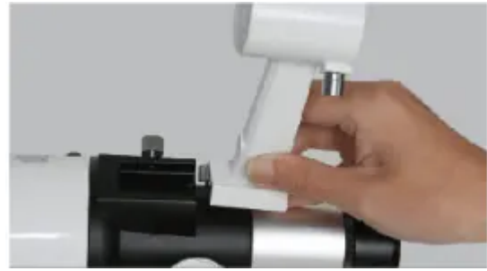
10. Slide finderscope base into body tube.