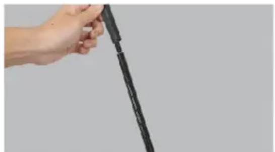
6. Pull out the thread cover.