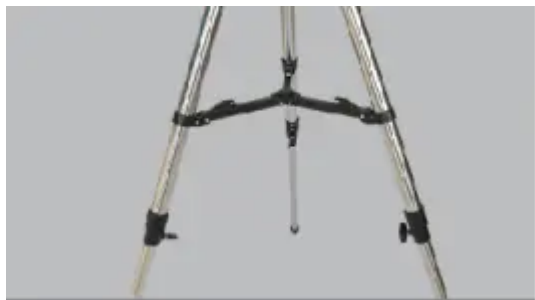
3. Spread the other two legs out in same length.