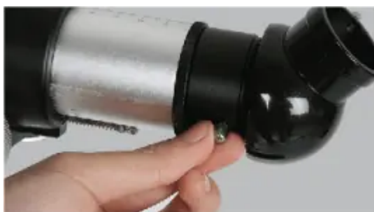
15. Tighten the screw on zenith screw.