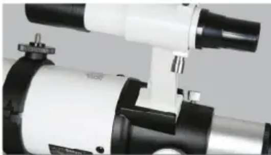
13. Adjust the three screws on base to make finderscope in the middle of the hole.