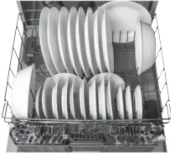
Lower Rack - 8 Place Settings GDF510 & GDT535