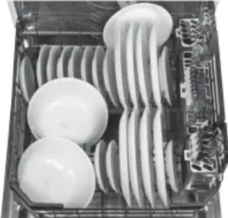
Lower Rack - 8 Place Settings GDF620 & GDT635