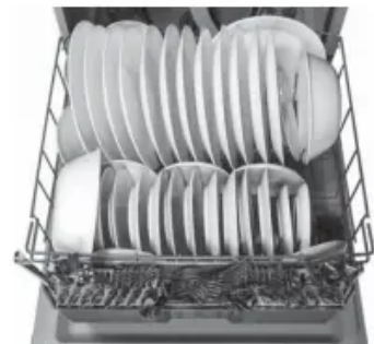
Lower Rack - 12 Place Settings GDF510 & GDT535