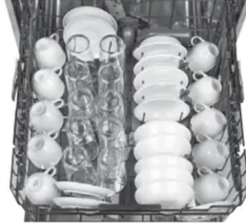
Upper Rack - 10 Place Settings GDF620 & GDT635