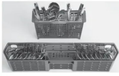
Silverware Basket - 12 Place Settings GDF520, GDF610, GDT545, GDT625 & ADT521