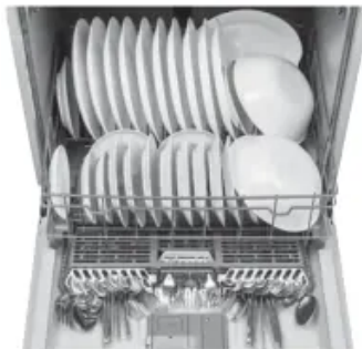
Lower Rack - 10 Place Settings GDF510 & GDT535