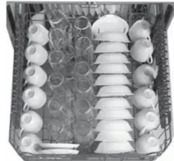
Upper Rack - 12 Place Settings GDF510-610, GDT535-545, GDT625 & ADT521