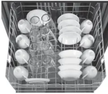
Upper Rack - 8 Place Settings GDF510-610, GDT535-545, GDT625 & ADT521