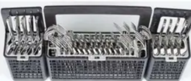
Silverware Basket - 12 Place Settings GDF620 & GDT635