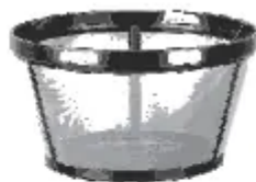
Mr. Coffee® Brand Permanent Filter