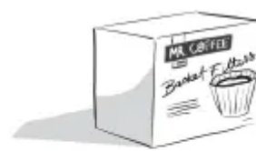
Mr. Coffee® Brand 10-12 Cup Basket-Style Paper Filters