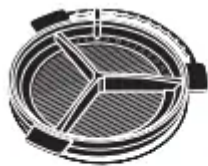
Water Filtration System