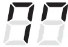
Duct Mode ON