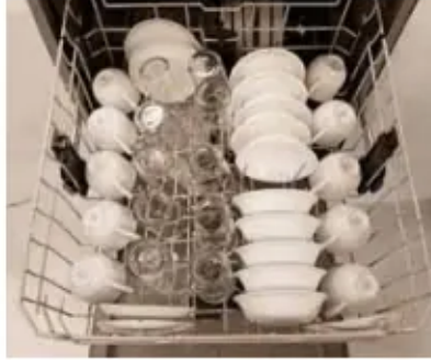
Upper Rack - 10 Place Settings GDF510, GDF511, GDT535