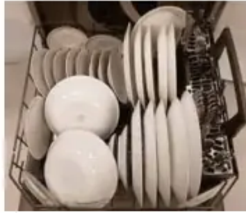
Lower Rack - 10 Place Settings GDF510, GDF511, GDF530, GDT535, GDT605, GDP615, GDT635