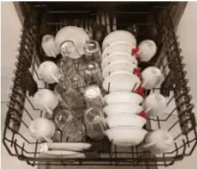
Upper Rack - 8 Place Settings GDF530, GDT605, GDP615, GDT635