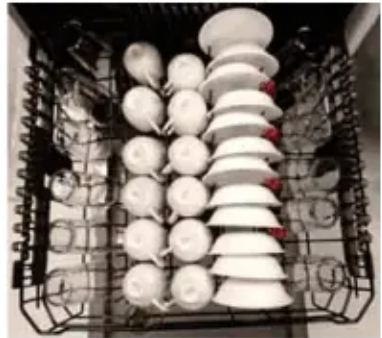
Upper Rack - 12 Place Settings GDF530, GDT605, GDP615, GDT635