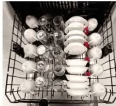
Upper Rack - 10 Place Settings GDF630 & GDF640