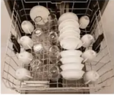
Upper Rack - 8 Place Settings GDF510, GDF511, GDT535