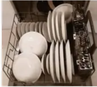
Lower Rack - 8 Place Settings GDF510, GDF511, GDF530, GDT535, GDT605, GDP615, GDT635