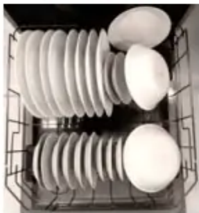
Lower Rack - 8 Place Settings GDF630* & GDF640*