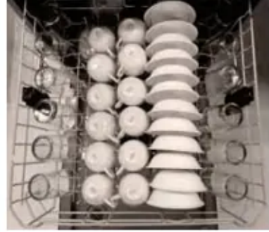
Upper Rack - 12 Place Settings GDF510, GDF511, GDT535