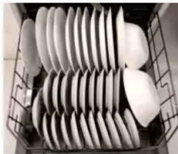
Lower Rack - 10 Place Settings GDF630* & GDF640*