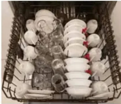
Upper Rack - 10 Place Settings GDF530, GDT605, GDP615, GDT635