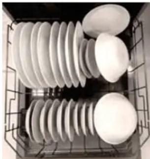
Lower Rack - 8 Place Settings GDF630* & GDF640*