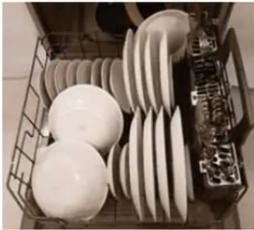
Lower Rack - 8 Place Settings GDF510, GDF511, GDF530, GDT535, GDT605, GDP615, GDT635