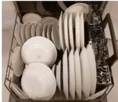
Lower Rack - 10 Place Settings GDF510, GDF511, GDF530, GDT535, GDT605, GDP615, GDT635