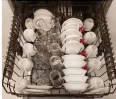
Upper Rack - 10 Place Settings GDF530, GDT605, GDP615, GDT635