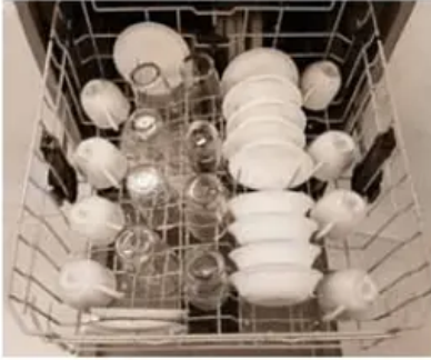
Upper Rack - 8 Place Settings GDF510, GDF511, GDT535