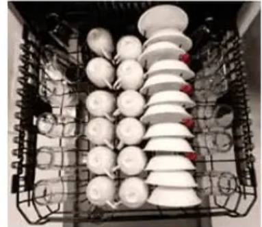
Upper Rack - 12 Place Settings GDF530, GDT605, GDP615, GDT635