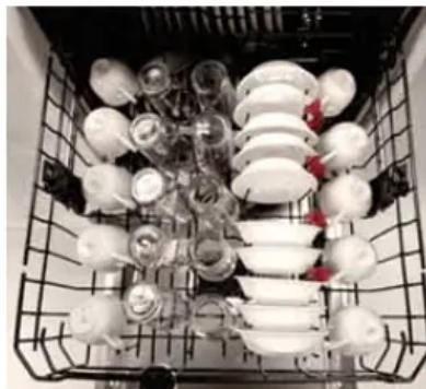
Upper Rack - 10 Place Settings GDF630 & GDF640