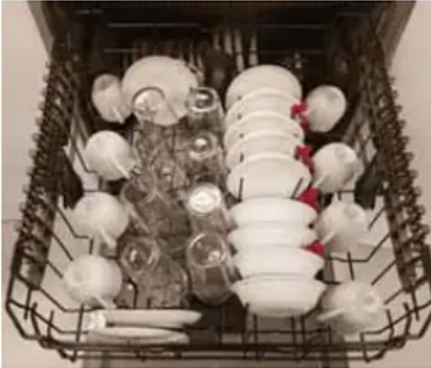
Upper Rack - 8 Place Settings GDF530, GDT605, GDP615, GDT635