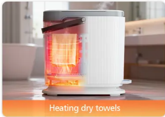
Heating dry towels