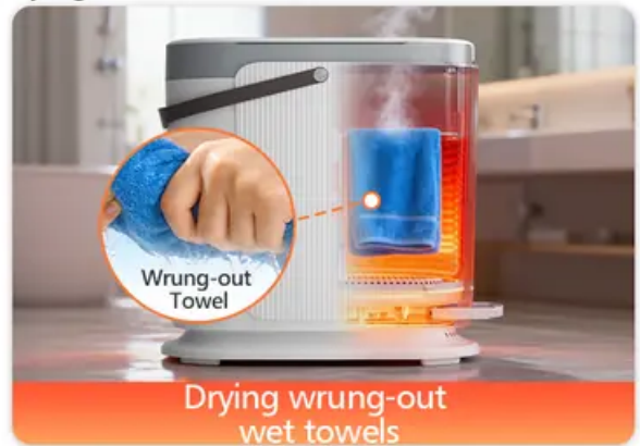
Drying wrung-out wet towels