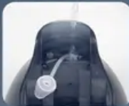
Easy to refill

Provides over 15 minutes of continuous steaming