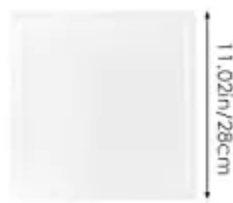
1* Fruit Roll Sheet