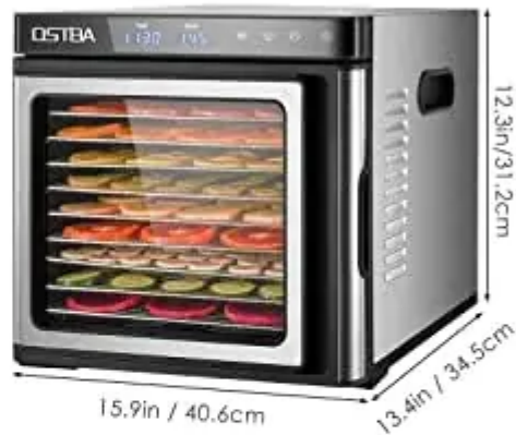
1*Stainless Steel Food Dehydrator