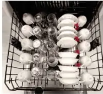
Upper Rack - 10 Place Settings GDF630 & GDF640