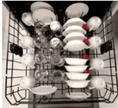
Upper Rack - 8 Place Settings GDF630 & GDF640