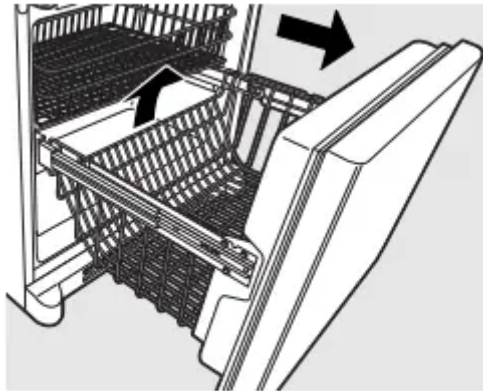
Appearance may vary

To remove the deep full-width basket on freezer drawer models: