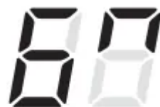
Class 2 ON