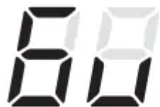
Class 2 OFF