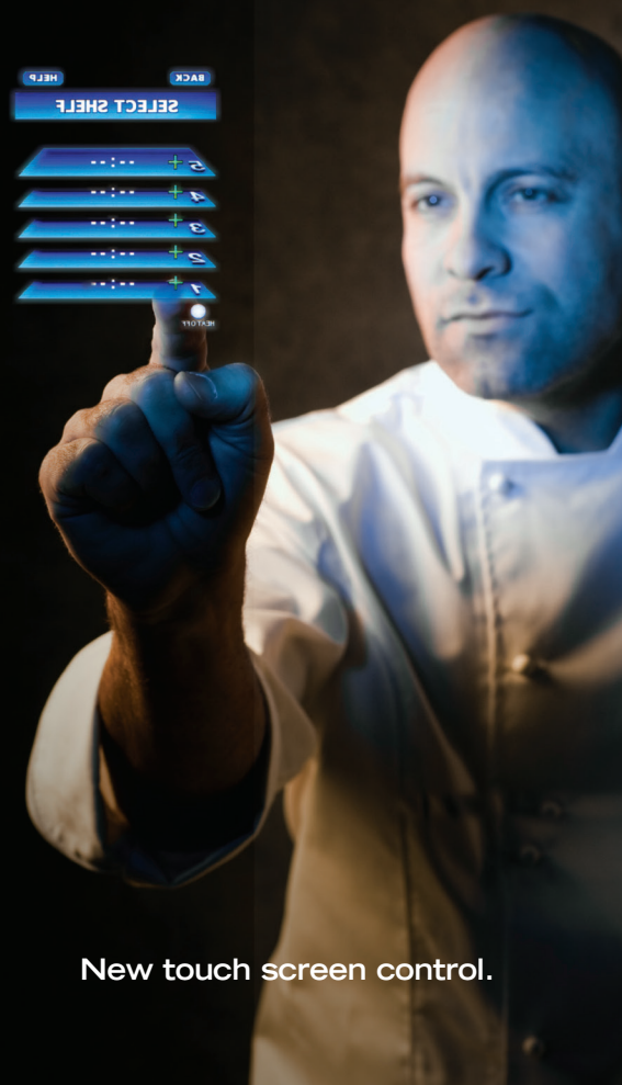
New touch screen control.