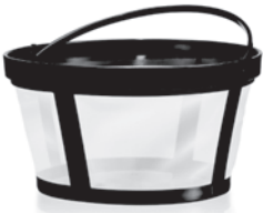
Reusable Coffee Filter