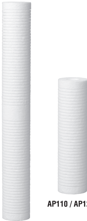
AP110 / AP124