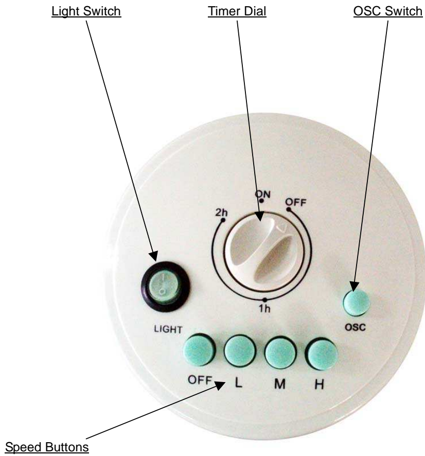
Fig.1 Control panel