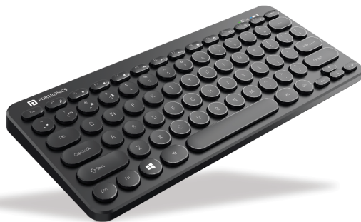
Multimedia Wireless Keyboard