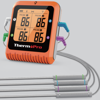
Bluetooth Cooking Thermometer

According to the operating system of your mobile, scan the following QR code to download and install.