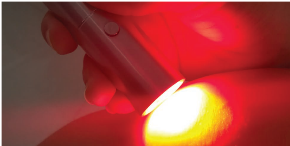
For knee treatment