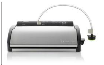
FoodSaver® Sealer With Accessory Hose and Container Adaptor

Works with FoodSaver® Vacuum Sealing Systems