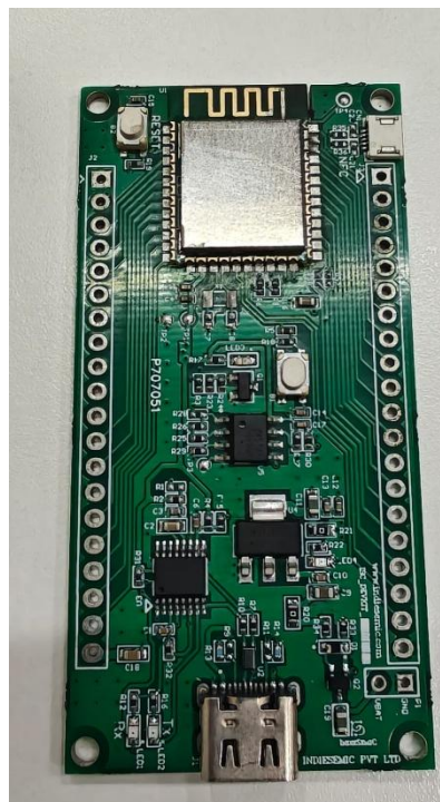
Figure 1 EVK_ISC_nRF54L

Connect Type C port with USB to Type C connector with Host Computer