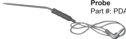
Probe Part #: PDA1