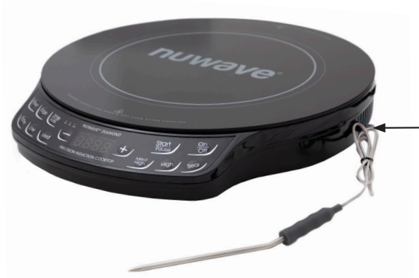
PIC® Diamond™ (side-view)