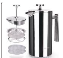
Secura French Press Coffee Maker