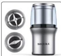
Secura Electric Coffee and Spice Grinder