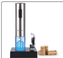
Secura Electric Wine Opener