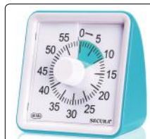
Secura Electronic Visual Timer