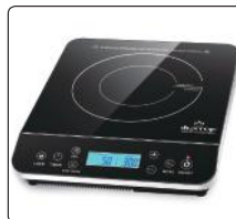
Duxtop 1800W LCD Induction Cooktop