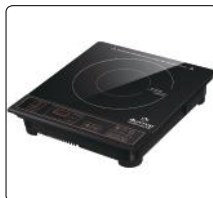
Duxtop Portable 1800W Induction Cooktop