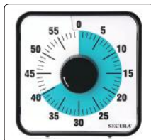
Secura Mechanical Visual Timer