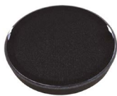
Front (Carbon Pre-Filter)

NOTE: The Activated Carbon Pre-Filter and True HEPA filter are not washable. DO NOT wet either side of the filter when cleaning.