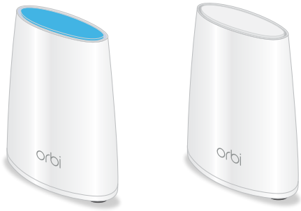
Orbi Router (Model RBR40)