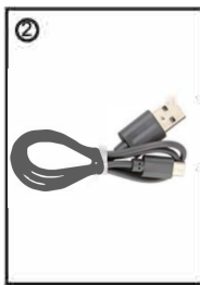
USB charging cable