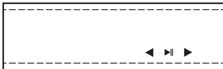
Bluetooth Headband Headphone