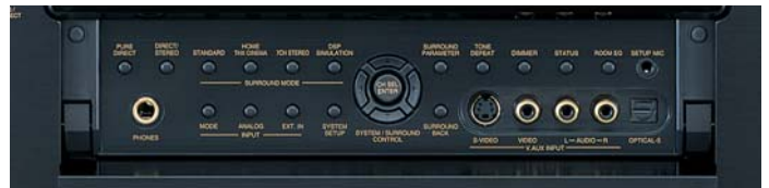
Inside of the trapdoor