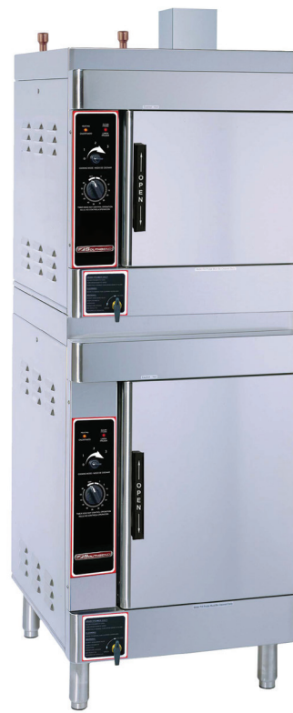
SIRIUS II-SB - 10