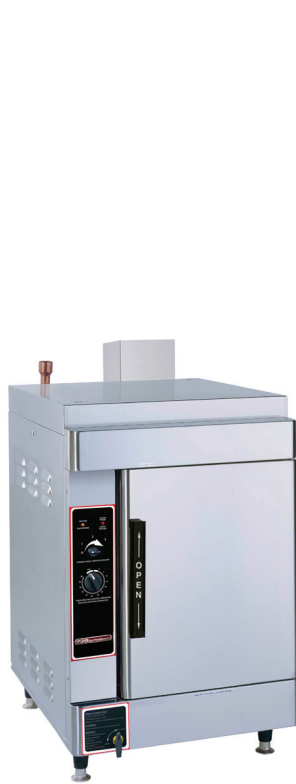
SIRIUS II-SB - 6