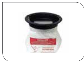
HEPA filter 16"