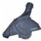
Dust hood for 4"-5" grinders