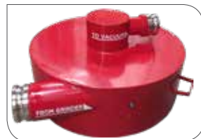
Deluxe drum pre-separator assembly