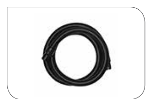
Hose 10 x 1.5 crush proof