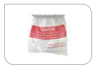
Dacron "never clog" filter bag