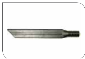
Crevice tool 17"