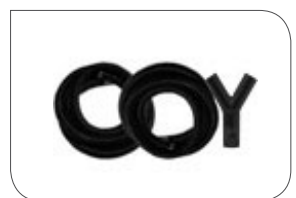
Hose kit, standard twin