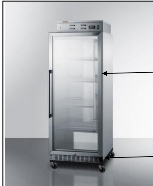
PHC115G Blanket Warmer