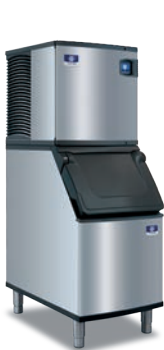
IT0420 D-320 Bin