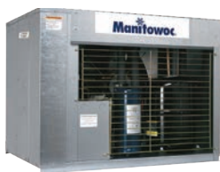
CVD Condensing Unit***