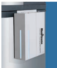
iAuCS (External Mounting)

AUTOMATICALLY. Choose from 1,2,3,4,5,6 month applications. Use with Indigo NXT modulars.