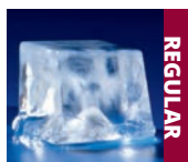
Available on UF0140 and UF0310