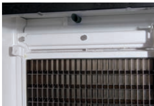
Ice machine equipped with LuminIce II