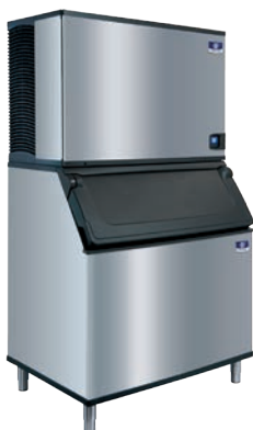
IT1900 D-970 Bin