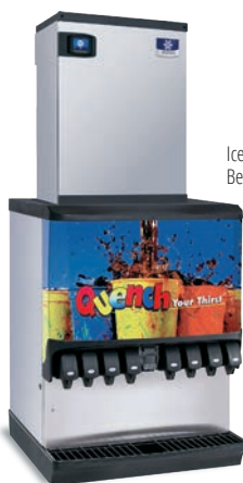
Ice/Beverage Series on Beverage Dispenser