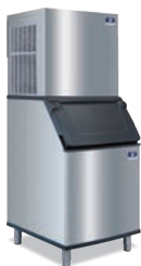
RFF1220C D-420 Bin