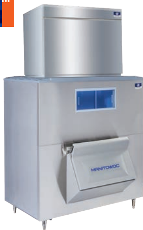
ST3000WH LB1760 Bin