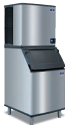
IT1200 D-570 Bin