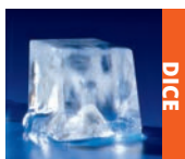
Available on all undercounters