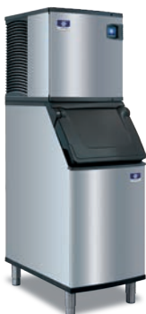
IT0620 D-420 Bin