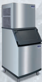
RFF1300 D-570 Bin