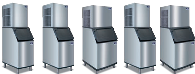
RNP0320 D-420 Bin