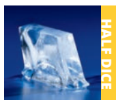
Available on all undercounters

These compact ice cube machines are ideal for small-volume ice production, for limited use needs, or as back-ups for larger machines. Specifically designed to fit beneath counters or in areas where floor space or height restrictions prohibit use of larger equipment. The petite size makes any of these models ideal for on-the-spot installations at coffee shops, stadium boxes, refreshment/break areas, or wherever limited ice needs require equipment with a small footprint.