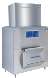
RFF2200C LB1760 Bin