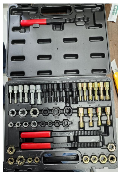
MODEL : XRSS061 MODEL : XRSS049