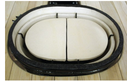
Heat Deflector Plates