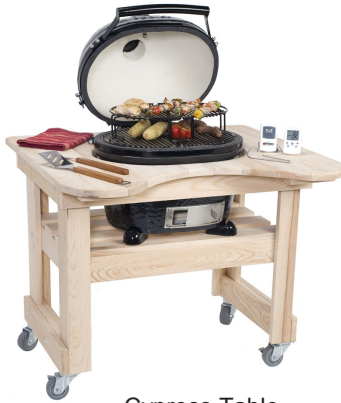
Cypress Table (featured w/Oval Jr.)