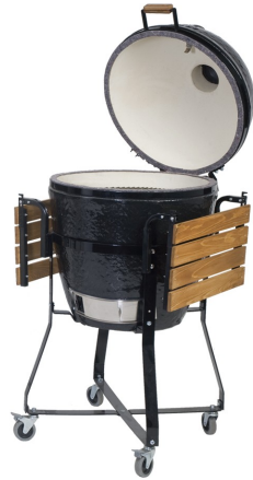
Cradle w/wood side tables (featured with Kamado)