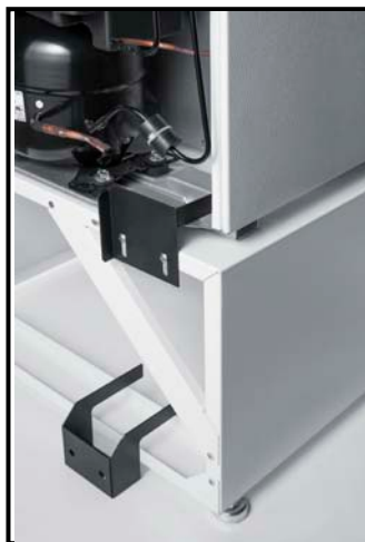
Refrigerator mounted on pedestal and positioned under Bracket 1