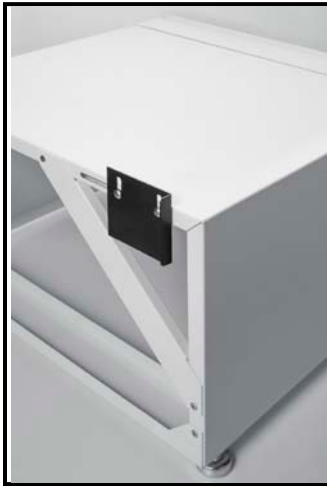
Rear of pedestal showing pre-mounted Bracket 2