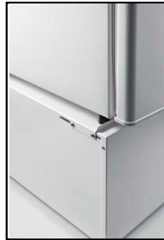
Front legs of refrigerator are positioned behind lip of pedestal