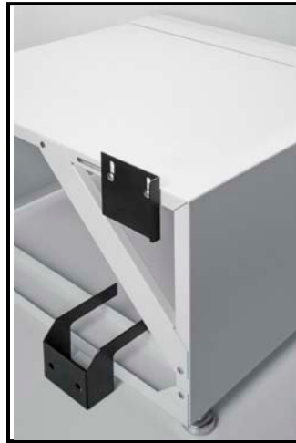
Bracket 1 mounted to the floor