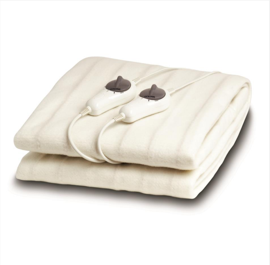
Model: GFTFS Series