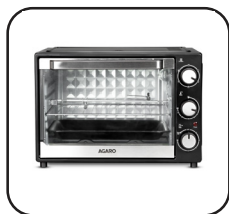
Oven Toaster Griller

To checkout wide range of AGARO products, please visit www.agarolifestyle.com