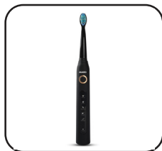
Electric Tooth Brush