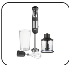
Hand Blender With Chopper