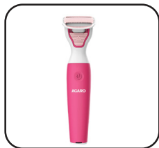
Female Electric Trimmer