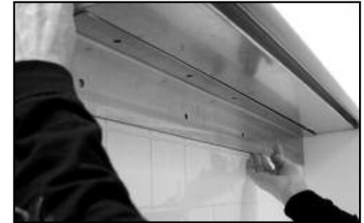
Photo 2b - Angle Bracket