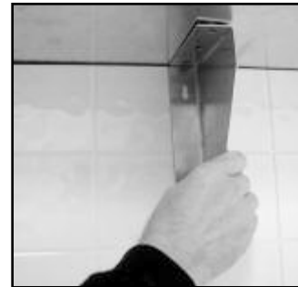
Photo 2a - Cantilever Bracket

(NOTE: Hardware for wall mounting not provided)